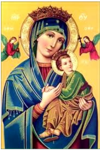
OUR LADY OF